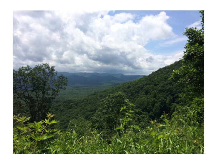
Some of the estimated $34-plus billion in heirs property in Georgia likely is covered with valuable timber that could be harvested more readily, and profit the owners, if the title were clear.

Black millennials are the next generation to face the issue of managing their heirs property, notably rural farmland, according to an essay