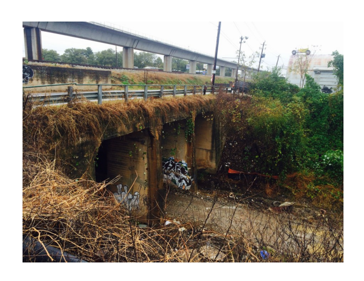
The Atlanta BeltLine's Southwest Trail was built through neighborhoods where city officials in 2015 expected some parcels needed for the project lacked a clear title.

(https://www.theatlantic.com/magazine/archive/2019/09/this-land-was-our-land/594742/) in the September edition of The Atlantic , titled, The Great Land Robbery: The shameful story of how 1 million black families have been ripped from their farms